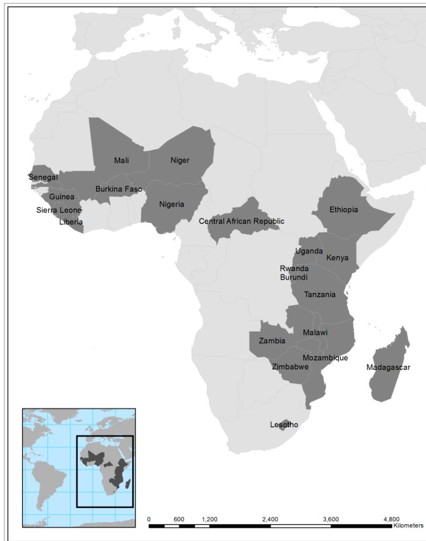
Figure 1: Map of countries examined in this research